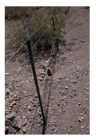
Typical tortoise fence installation