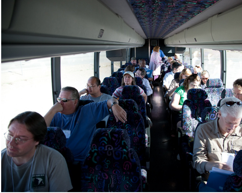
Committee members on the bus