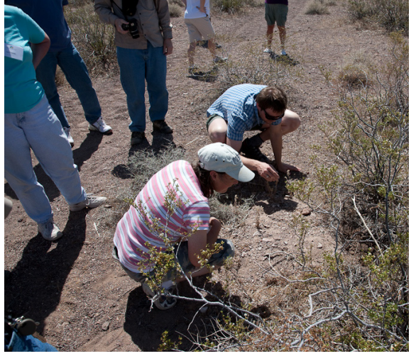
Committee members view the abandoned tortoise burrow

Following the stop at the tortoise fence, the committee viewed an abandoned tortoise burrow adjacent to an illegal motorcycle trail.