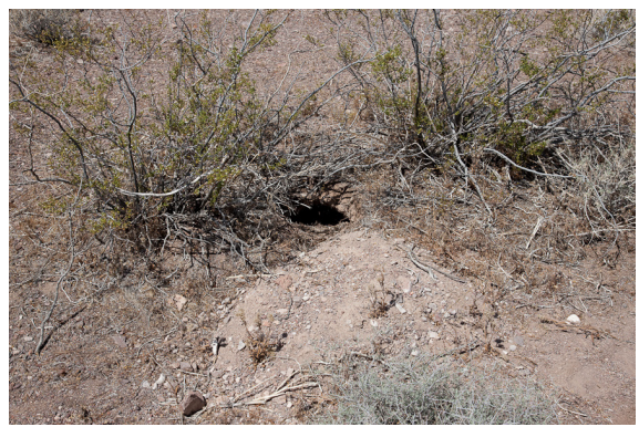
Abandoned Desert Tortoise burrow adjacent to an illegal motorcycle trail