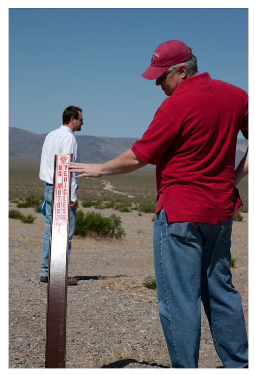
No Motor Vehicles sign posted at race course