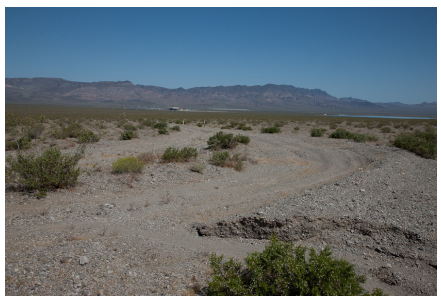
View of the damage done to the desert by the illegal race course