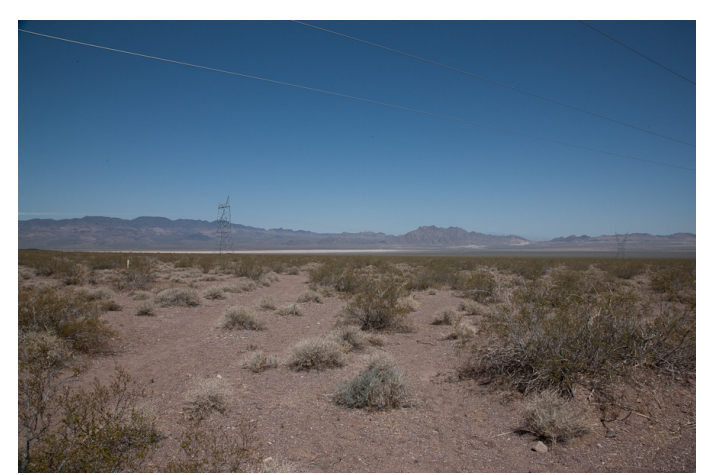
View of the desert on the Boulder City Conservation Easement

Following the visit to the Sunrise Mountain ACEC, the committee returned to the Clark County Government Center and arrived at approximately 2:45 p.m.