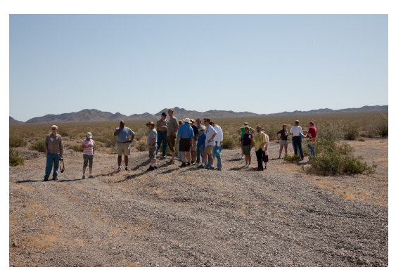
Committee members and staff view the race course